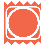
Protection from STDs