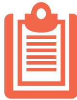
Past History of STDs